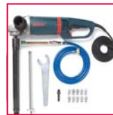
Right Angle Grinder