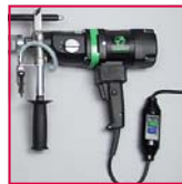
Hand Held Drill

The Core Wizard 2-8 Kit includes Carrying Case, Guide post, Drive shaft, Water line, Concrete Anchors, & Manual. Right angle grinders and hand held core drill motors sold separately.