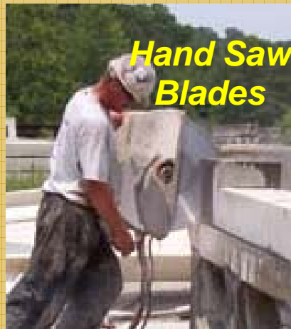
Hand Saw Blades