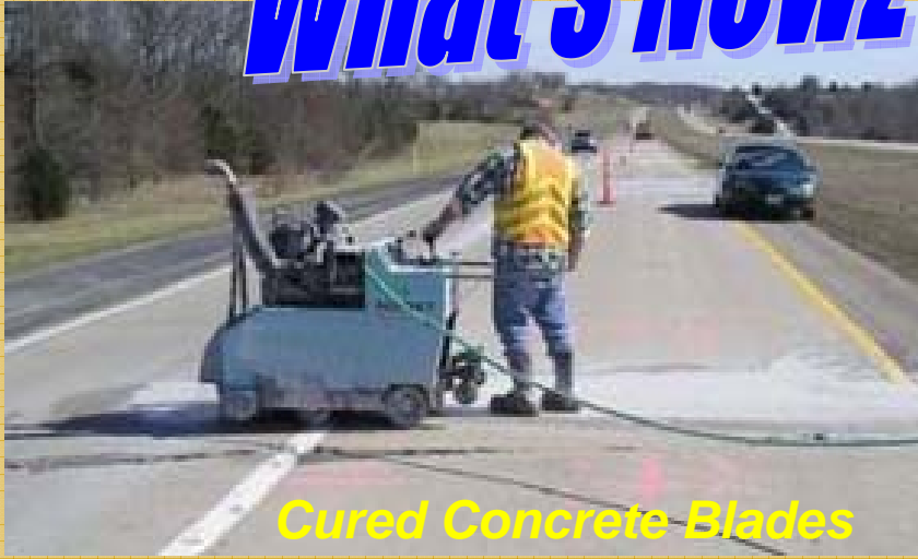
Cured Concrete Blades